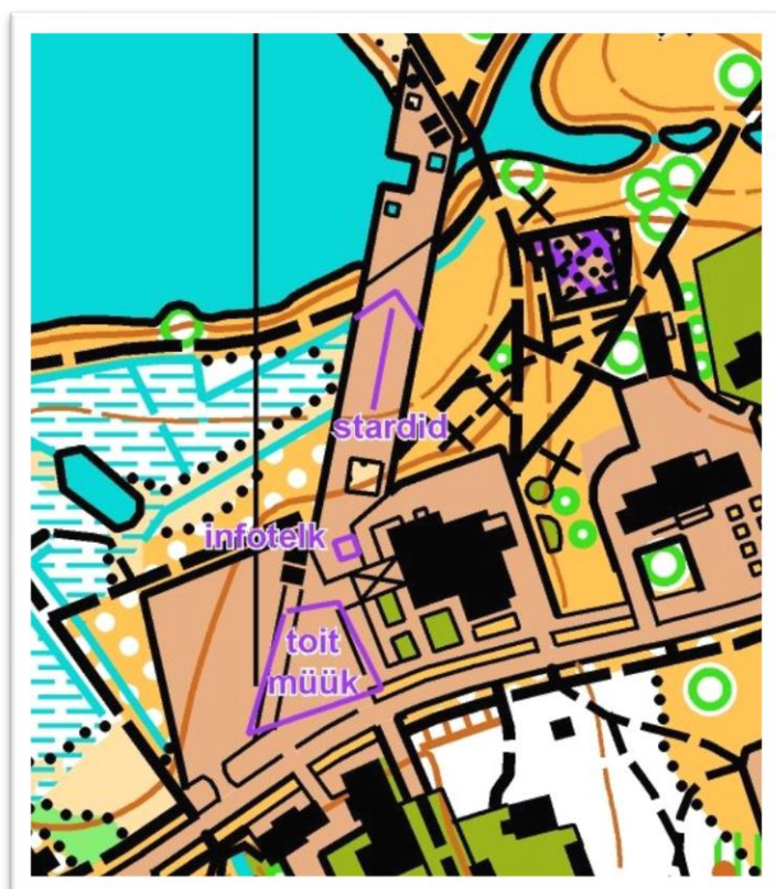
2st day. City of Elva.

We advise all orienteering clubs to bring their own tents to the competition centre as parking is situated further away.